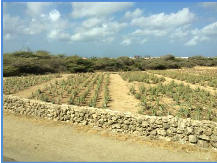
We toured an Aloe plantation and processing factory in Oranjestad, Aruba. On the country side drive we saw that it is a very dry island with all kinds of cacti.