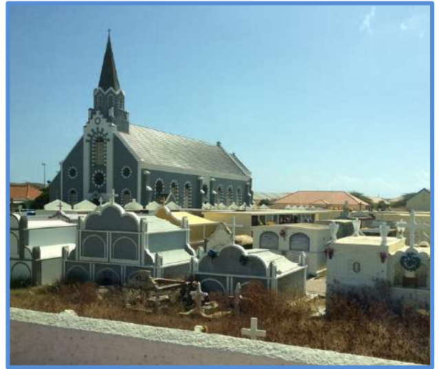
A church and above ground cemetery in Aruba.