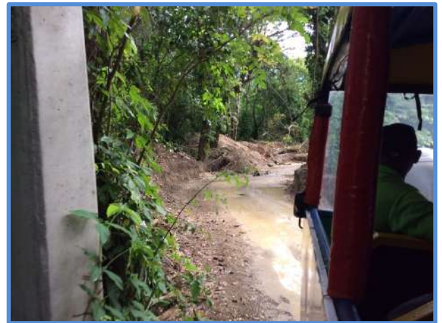
In the Dominican Republic we took a country side safari, local style and some of the roads looked like this. We crossed open streams as well. Main roads were paved.